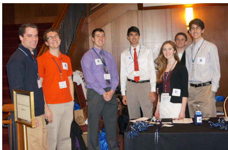
Virginia Tech student volunteers manning the registration table.

Before the conference, the majority of the planning responsibilities fell onto the shoulders of a committee of about ten juniors and seniors. These students applied for their positions on the conference committee and worked hard over the 2013-2014 school year to