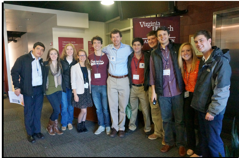
Virginia Tech IIE members at the Virginia Tech Smart Road

Over 200 students from ten universities on the east coast, sponsors from five companies (Lowe's, PepsiCo, UPS, Deloitte, and Newport News Shipbuilding), and a few of our own VT faculty members attended the conference. The weekend began